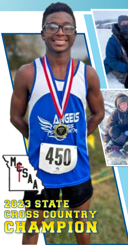
2023 STATE CROSS COUNTRY CHAMPION