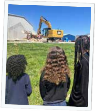
▲ Students watched the La Monte campus come alive with construction as old building were removed to make way for the new additions.

All year, the children watched as various kinds of large construction equipment moved across the La Monte campus. Old structures were tore down. Earth was leveled and loads of gravel arrived. Lumber stacked higher. Foundations were poured and walls began to rise where open ground once sat. Some students checked progress on their walk to class. Others pressed closer to the windows to see what had changed since the day before.